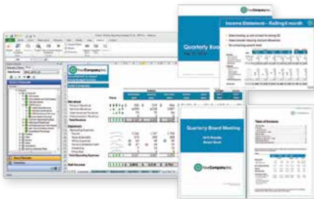
Dynamic Excel Reports Intelligently Linked to Adaptive